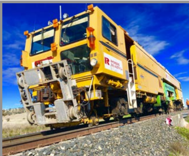
09-3X – Automatic Levelling, Lining and Tamping Machine