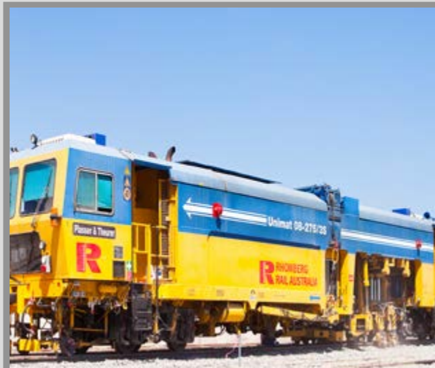
Unimat 08/275 – Turnout and plain track tamper with 3rd rail lifting