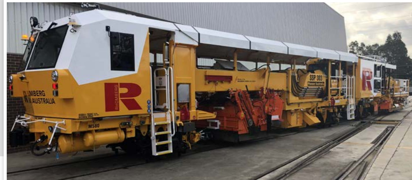
SSP 303 - Ballast Regulator

SSP 303 – Ballast Regulator SSP 303 – Ballast Regulator SSP 305 – Ballast regulator