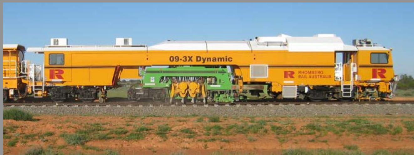
09-3XD & DTS – Automatic Levelling, Lining and Tamping & Dynamic Stabilising Machine