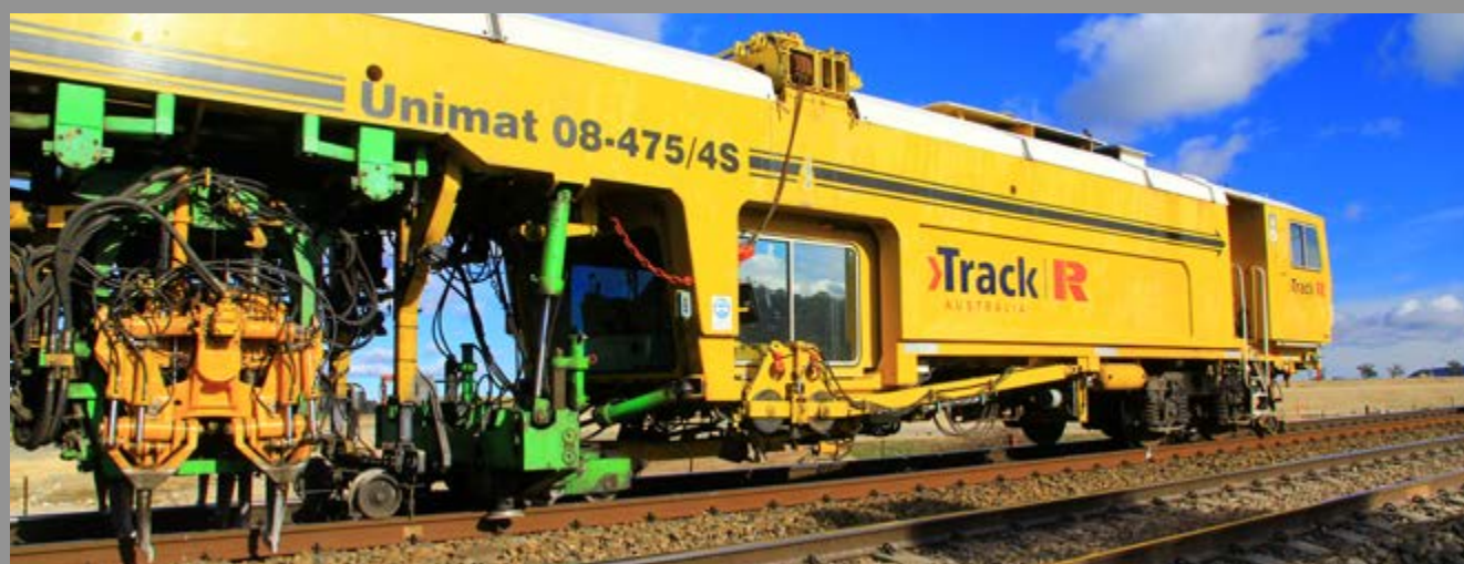
Unimat 08-475 4S – Turnout Tamping Machine with integrated Ballast Management